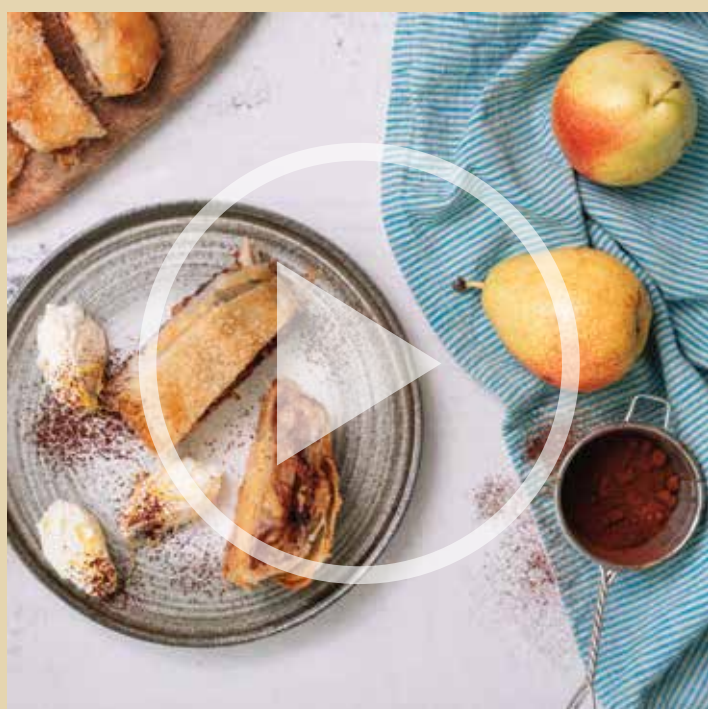
Pear and chocolate strudel with unrefined cane sugar