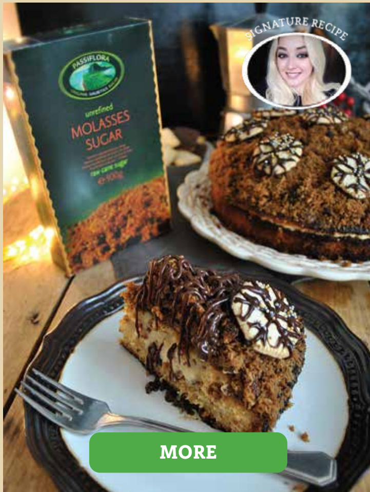
Danish cake DREAM with Molasses sugar